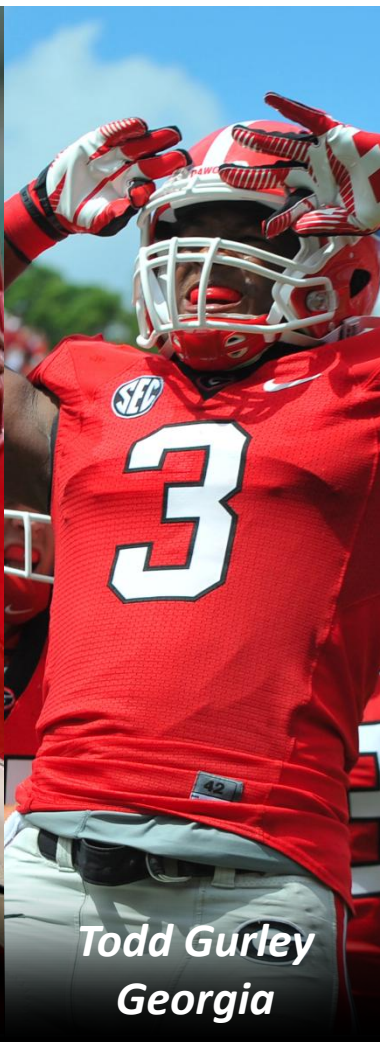
Todd Gurley Georgia