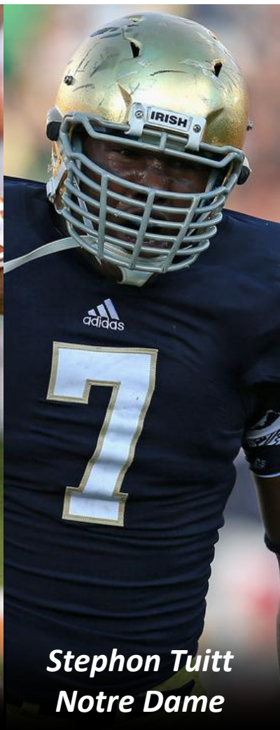
Stephon Tuitt Notre Dame